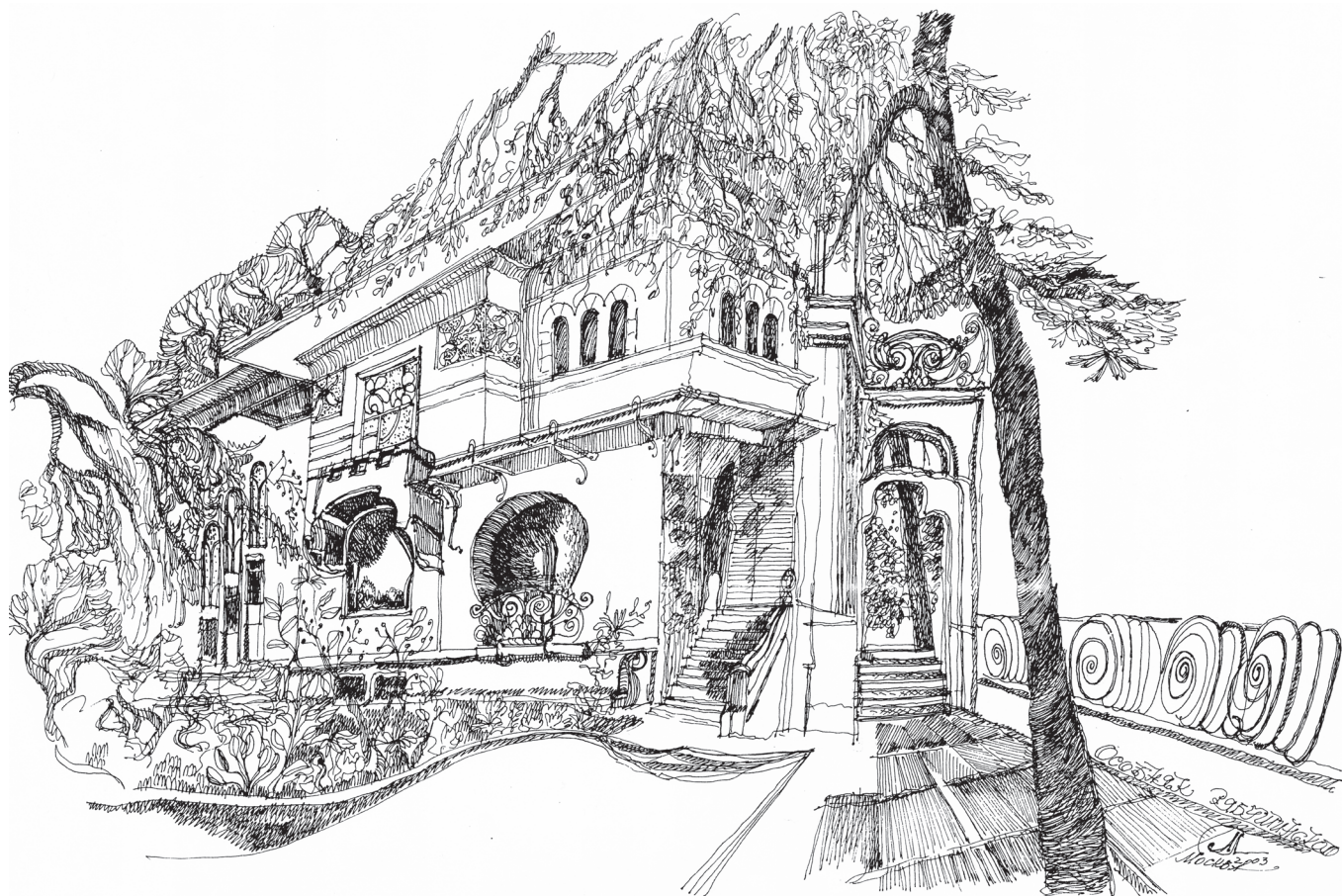
Л.И. Павлова. Москва. Особняк Рябушинского. Рисунок, тушь, перо

Для цитирования: Королева О.Н., Королева Е.Н. Some issues of the integrated development of public transport in the Barnaul agglomeration // Недвижимость: экономика, управление. 2021. № 4. С. 49–52.