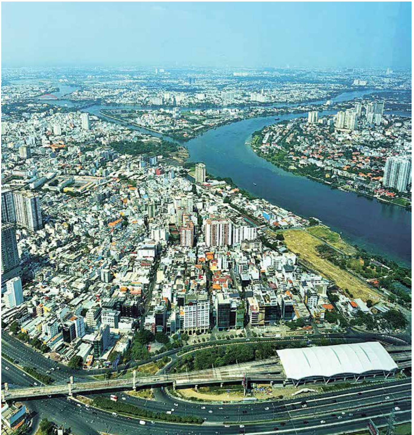
Вид на город, смотровая площадка Небоскрёба Landmark, 81, Хошимин, Вьетнам

Для цитирования: Стоянов И.П. Factor space for construction of pile foundations in permafrost soils // Недвижимость: экономика, управление . 2024. № 1. С. 51–54.