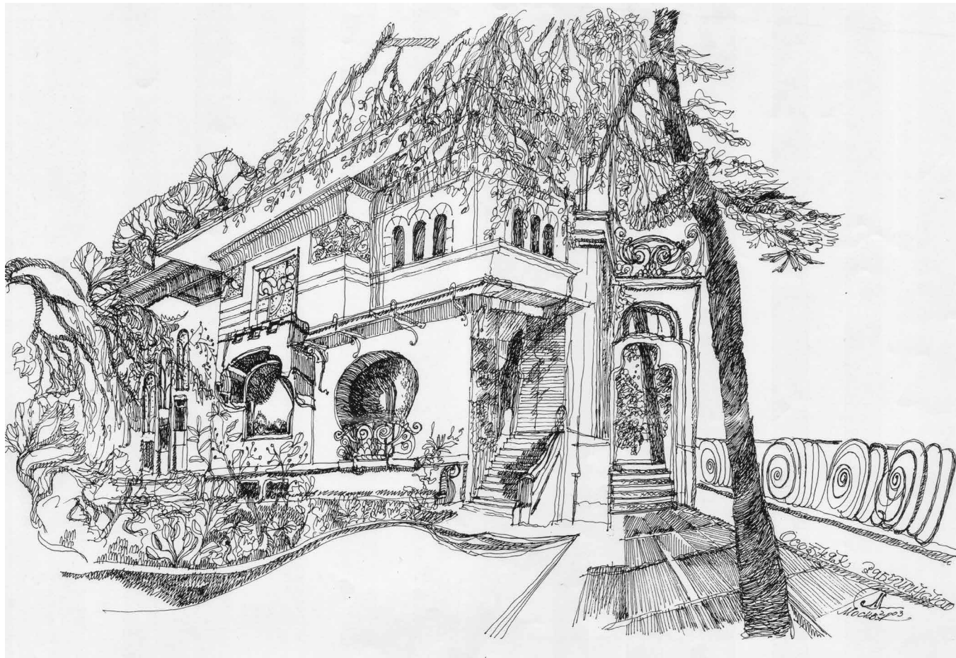
Л.И. Павлова. Москва. Особняк Рябушинского. Рисунок, тушь перо.

Для цитирования: Желиховский Д.О., Беляков С.И. Methodological approaches to the formation of flexible structures for managing construction groups // Недвижимость: экономика, управление. 2023. № 1. С. 39–43.